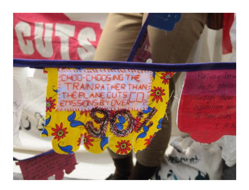
Image 2 – Example of stitched passenger car reading: 'Choo-choosing the train rather than the plane cuts CO2 emissions by over 90%'