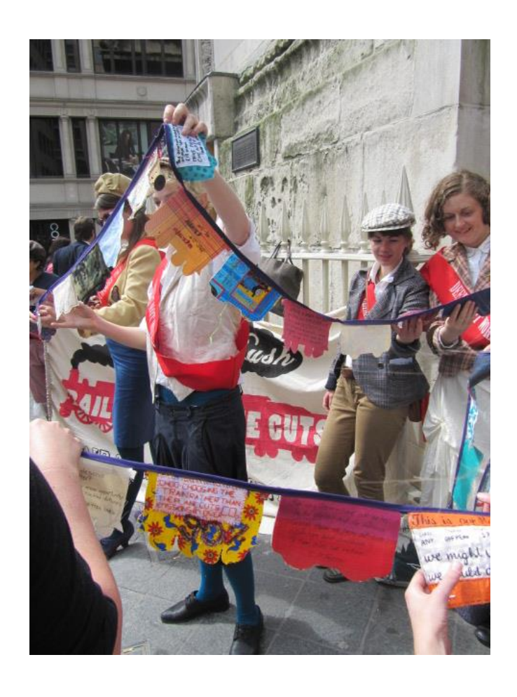
Image 3 – Petition-train formed from individual stitched passenger cars

After the rally, participants marched to a nearby train station. Here the plan was to use prepaid 'Oyster' cards which would allow the protesters to get on the train to Canterbury without paying the normal fare of over £25. The protesters believed that this was legal as long as they did not leave the train station in Canterbury but returned to the station at which they originally boarded. They accepted to pay a penalty of just over £7 upon returning to the original station, arguing that £7 was the equivalent fare for a journey of the same length in many countries in continental Europe. Waiting for the next train to arrive,