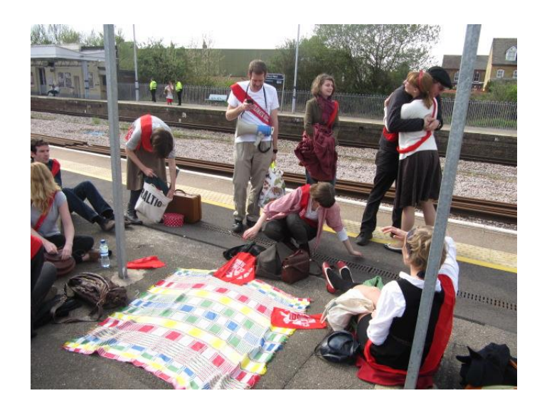
Image 5 – Setup of picnic at Canterbury Station, marking end of the Unfair Fare Dodge.

Not only were the DFEs used to frame the events in particular and novel ways, but they can also be seen to play a role in promoting the more typical features of contentious politics such as WUNC displays. Each of the displays (worthiness, unity, numbers, commitment) were exhibited during the course of the events and through the DFEs.