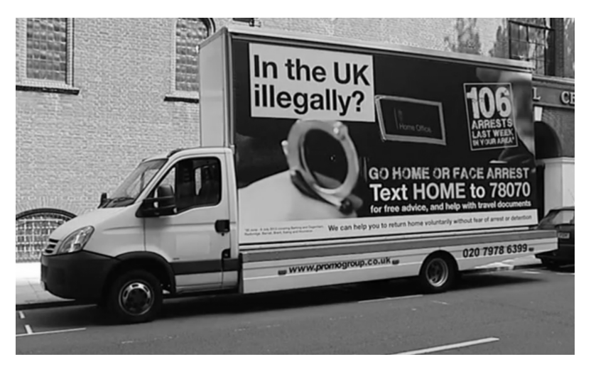
Figure 1: Go Home van

That a single image of a government immigration policing campaign can bring up such thoughts and feelings begins to suggest something of the emotional, existential and political textures of contemporary immigration control - the 'submitting to the will of heaven' - of which the crossing of national borders and citizenship rights is just one part. For those like Lucee, the Go Home campaign is frightening because it might inflame the hostility and racism that she has already faced in her local community. Sara's stream of consciousness is deeply gendered; the figures of an aggressive and volatile husband and a host country are almost interchangeable (see also Gunaratnam and Patel, 2015). The questions Sara asked in imagining a homeless and abused wife - 'Where will she live? Where will she go?' - when transposed into the contemporary political vocabulary of the nation state can be read as: Who belongs? Who can move and how easily? Who can stay? For how long? And on what terms?