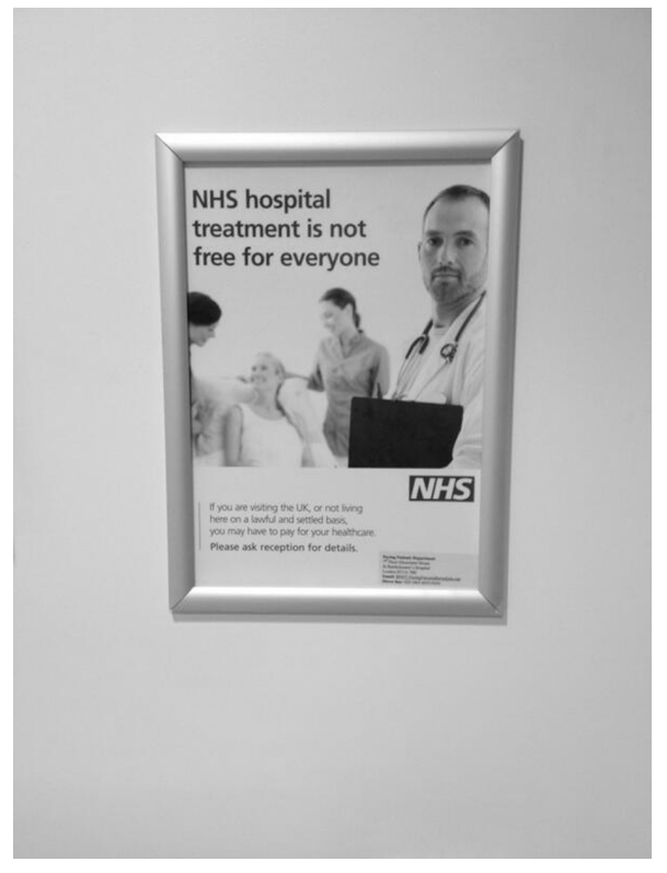
Figure 2: Signs in NHS on limited rights to healthcare for some migrants

internal audience to the most coercive elements of border control through invitations to witness its performance, along with the overall effort of communication and will to embody authority, all point to the locations of performative labour in these endeavours. We have understood the campaigns that we analysed as representing this range of tactical performances.