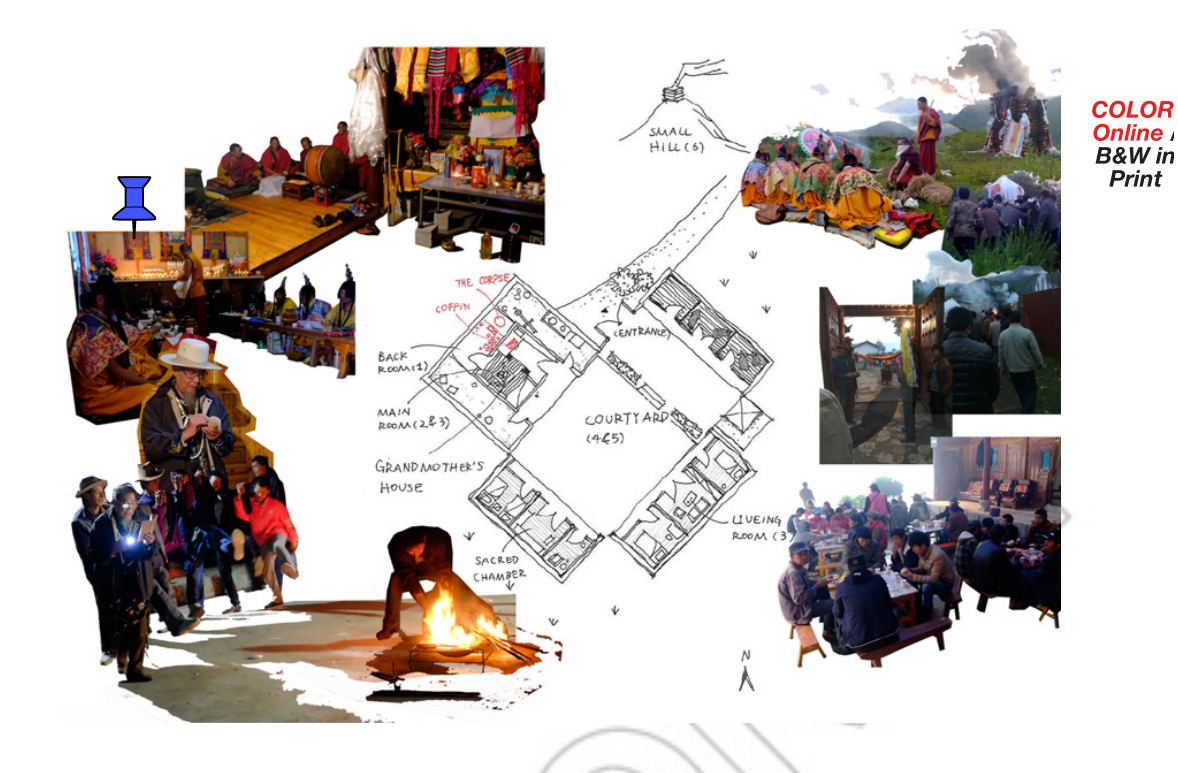
Figure 1 Different stages of Mosuo funeral rituals and activities in the courtyard: (1) preparation of the body, (2) decoration of the temporary mourning hall, (3) religious chants, (4) food celebrations, (5) bonfire dance and (6) cremation.