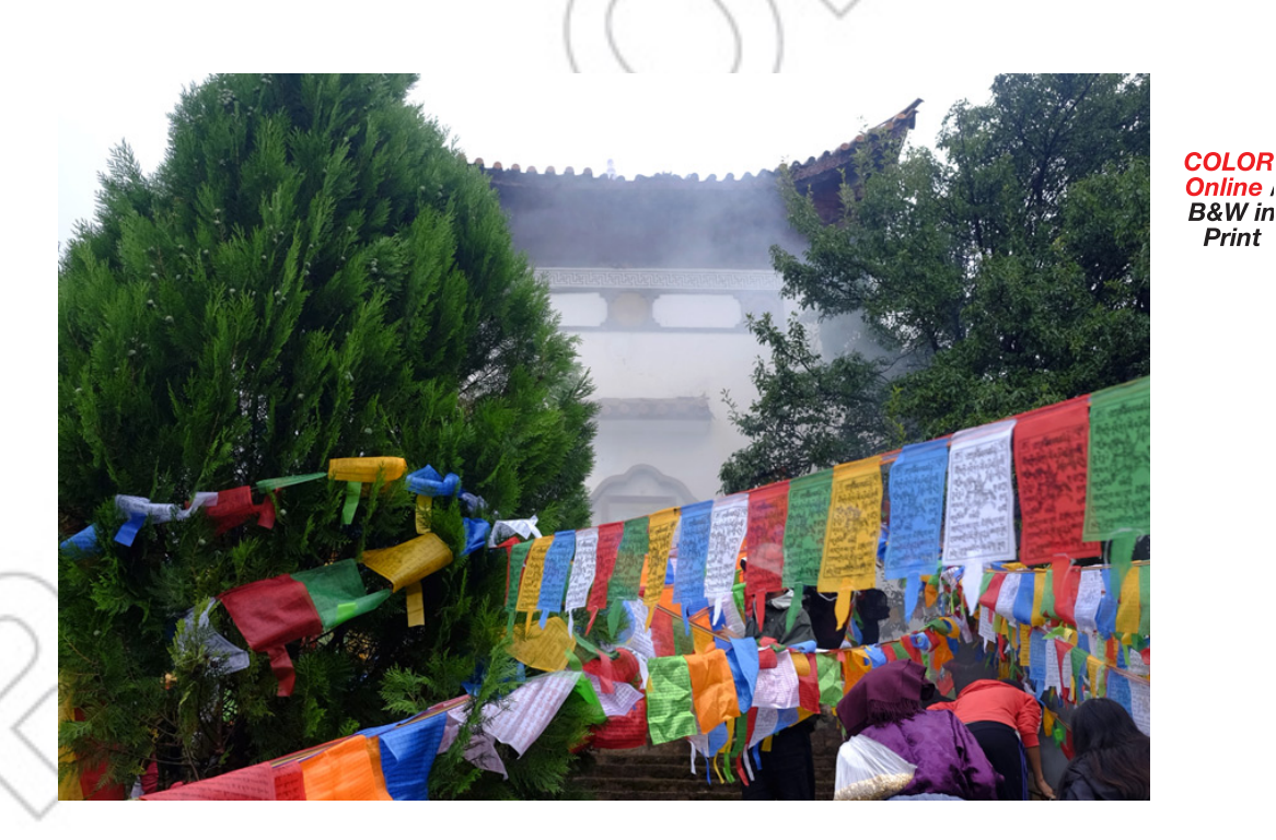
Figure 2 "Circle-the-Mountain" festival.

that ordinarily functions as a storeroom for grains, preserved pork, potatoes and other kinds of food, becomes a mortuary. What remains the same in both funerals and everyday life is the symbolic meaning of the grandmother's house, as a center to conduct rituals of the life cycle.