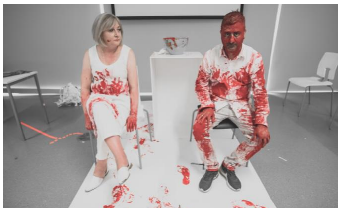
Figure 2 and 3. Selected images of speakers at ‘Beyond Borders:

Approaches and Pathways to Arts, Design & Media research’ conference, July 2017