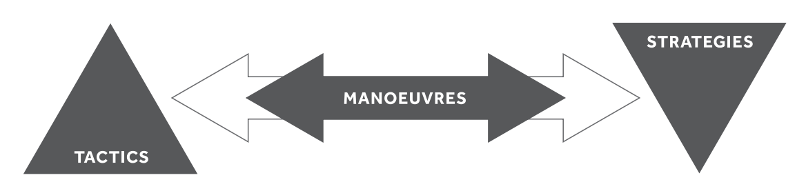
Fig 3, Manoeuvres Act Between Tactics and Strategies

The fine line between success and failure seems to be reliant on three key processes: 1. Tactics – bottom-up activities which take advantage of local conditions, engage local communities, undertake direct action and construct a collective vision for the project; 2. Manoeuvres - in which tactics are undertaken strategically, and strategies are exploited tactically to negotiate and exploit formal processes to unlock the formal systems necessary to realize the project; and 3. Strategies – Top-down strategies that affect the realisation of the project in positive ways (such as grants to support community-led initiative) and restrictive ways (such as legal contexts and land ownership) that can work either to advantage or disadvantage the project (see fig. 3).