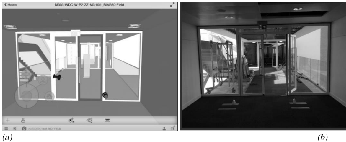
a) View of the Information Totem in yellow from the cloud based federated BIM model. b) Photograph of the same location on site as cross reference retrieved from the information totem.