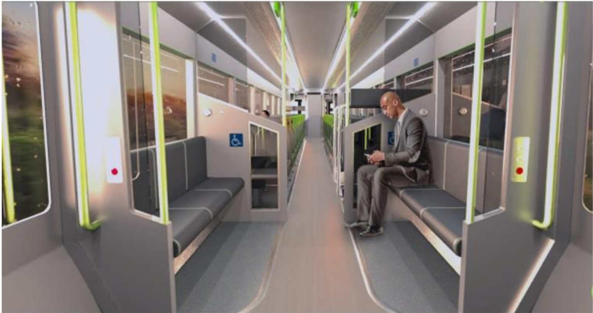
Above: BoUltra train interior illustration