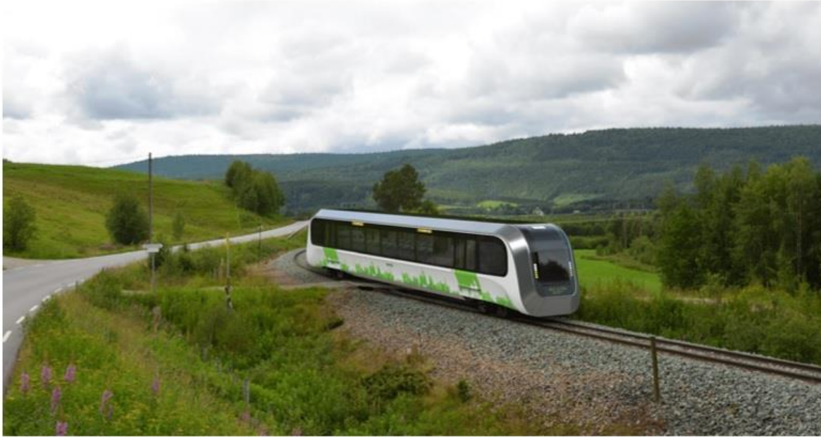
Above: BioUltra train illustrated on-track

We gained wide press coverage in The Times , The Independent , The Daily Mail and as far afield as UAE , India and USA in pieces highlighting some of the advantages of the BioUltra offering a lower-cost, safer, quieter, more comfortable, cost-effective, ultra lightweight, net negative carbon, mass-transit alternative.