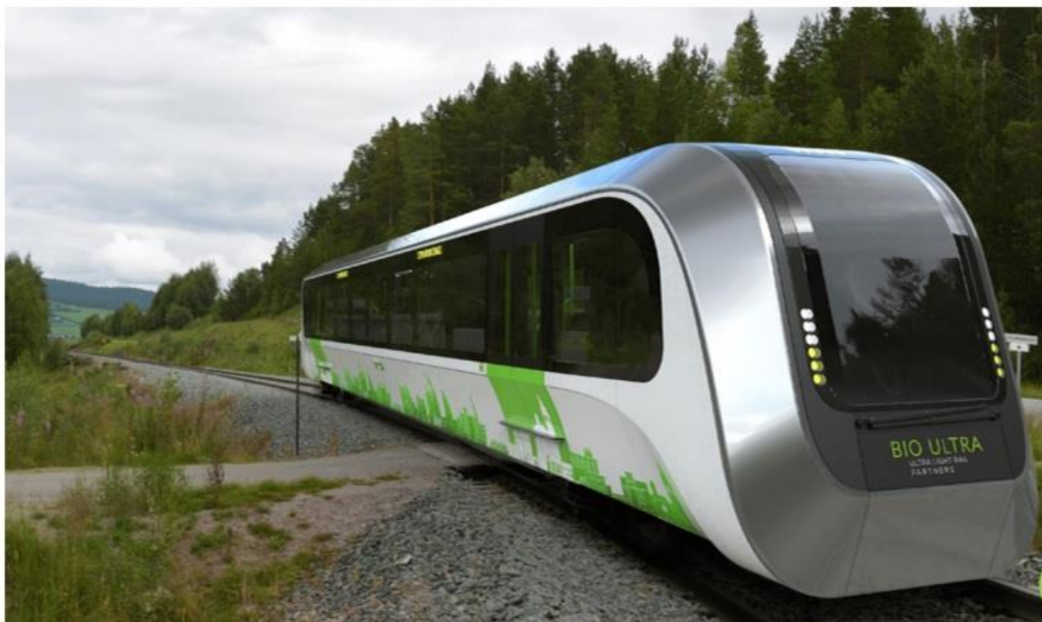
Above: BioUltra train illustrated on-track