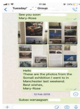
Sharing the exhibition photographs with the mothers on WhatsApp – 9 February 2019