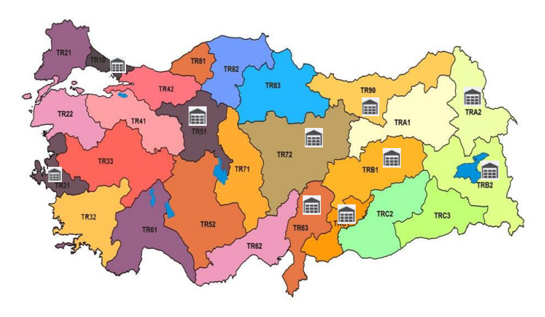
Figure 3. Top 10 regions listed in the rank of frozen food storage facility location

The regions in the north part of Turkey (Regions TR42, TR81, TR82, and TR83) except TR90 do not have a good potential for frozen food facilities. Those re ions have insufficient power plants in terms of population and labor availability; they have disadvantageous (see Table 5 and Table 6). The regions in the south part of Turkey (Regions TR52, TR61, and TR62) also do not have the potential for frozen food facilities. In addition, they have disadvantages in climate and government incentives. Besides all these shortcomings, they have advantages in the issues of hospitality capacity and the number of ports. However, they could not move these regions to the top of the ranking due to their disadvantageous issues.