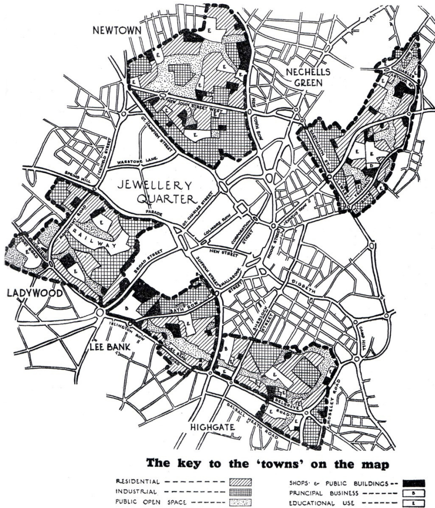
Figure 1. The five “new towns,” otherwise known as reconstruction areas.

innovative and understandably focused much attention on improving the city core, although this held major implications for the rail lines serving the docks. There were also proposals for “community planning” and suburban extensions (decentralisation, not further sprawl) and for a Humber bridge. The plan, completed after Lutyens’s death, was published as a well-illustrated large-format book, with a local exhibition opened by the minister (“Professor Abercrombie’s plan,” 1946). Abercrombie considered that this was “probably the best report he had been connected with” (Dix, 1981, p. 1222), and he contributed most to it, given Lutyens’s illness.