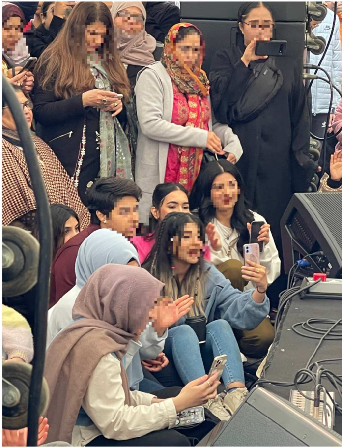
Figure 3. Young Muslim women singing along with the Qawwali musicians at the Glasgow Mela 2022. Photo by the authors, 26 June 2022.

by young Scottish individuals of South Asian origin, passionately singing, clapping, and dancing along with the Qawwali singers (see Figure 3 ), showcasing the hybridity of cultural materials and the continuity of traditions across generations.