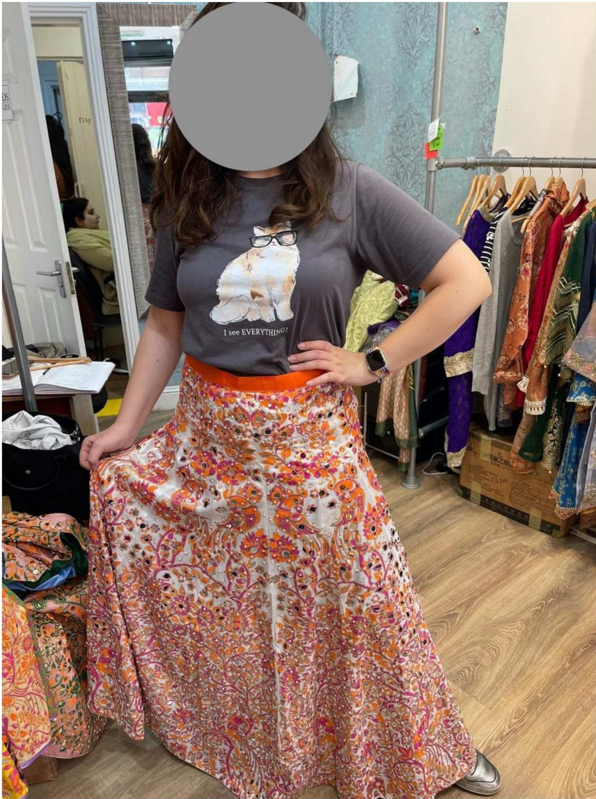
Figure 6. One of the author's trying on a lehenga. Note the beauty parlour at the back, which is a common feature of many South Asian fashion stores on Glasgow's Cathcart Road. 25 June 2022.

Despite most consumers of South Asian fashions in Glasgow aligning with 'global identities', their lack of interest in and awareness of the social, environmental, and ethical impacts of these fashion items highlight the need for raising consumer awareness and knowledge, particularly in a context where sustainability has become a frequent topic in public discourse.