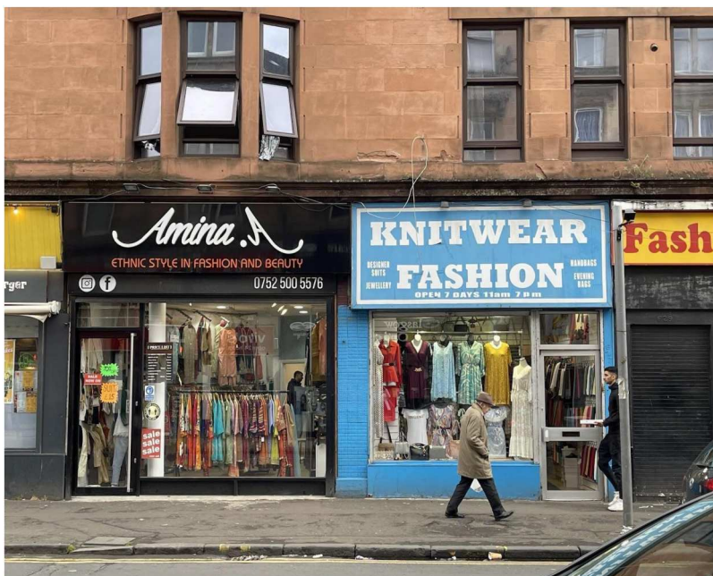
Figure 1. Stores selling South Asian clothes and fabrics on Glasgow's Cathcart Road. Photo by the authors, 11 September 2022.

Cathcart Road in the Southside emerged as a central location for South Asian fashion, hosting numerous stores. The research involved visits to these stores, browsing style catalogues, observing individuals trying on clothes, engaging in conversations with shoppers, shop owners, and salespeople, as well as personal experiences of trying on and purchasing clothes (see Figure 1). Photographs were taken of clothing and accessories in stores and shop windows. South Asian fashion brands' catalogues,