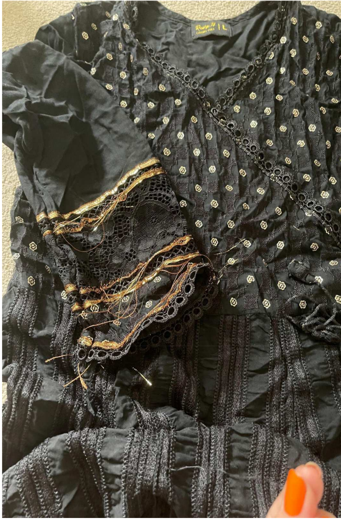
Figure 7. The salwar kameez after two washes. Photo by the authors, 17 October 2022.

nuanced consumer identities all contribute to a rich tapestry of diasporic fashion practices. To further illustrate these dynamics, we now turn to the personal stories of our informants, Zeenat and Miriam. Their lived experiences provide a deeper insight into how these macro trends manifest in individual lives and practices, thus highlighting the personal and communal dimensions of fashion within the South Asian diaspora.