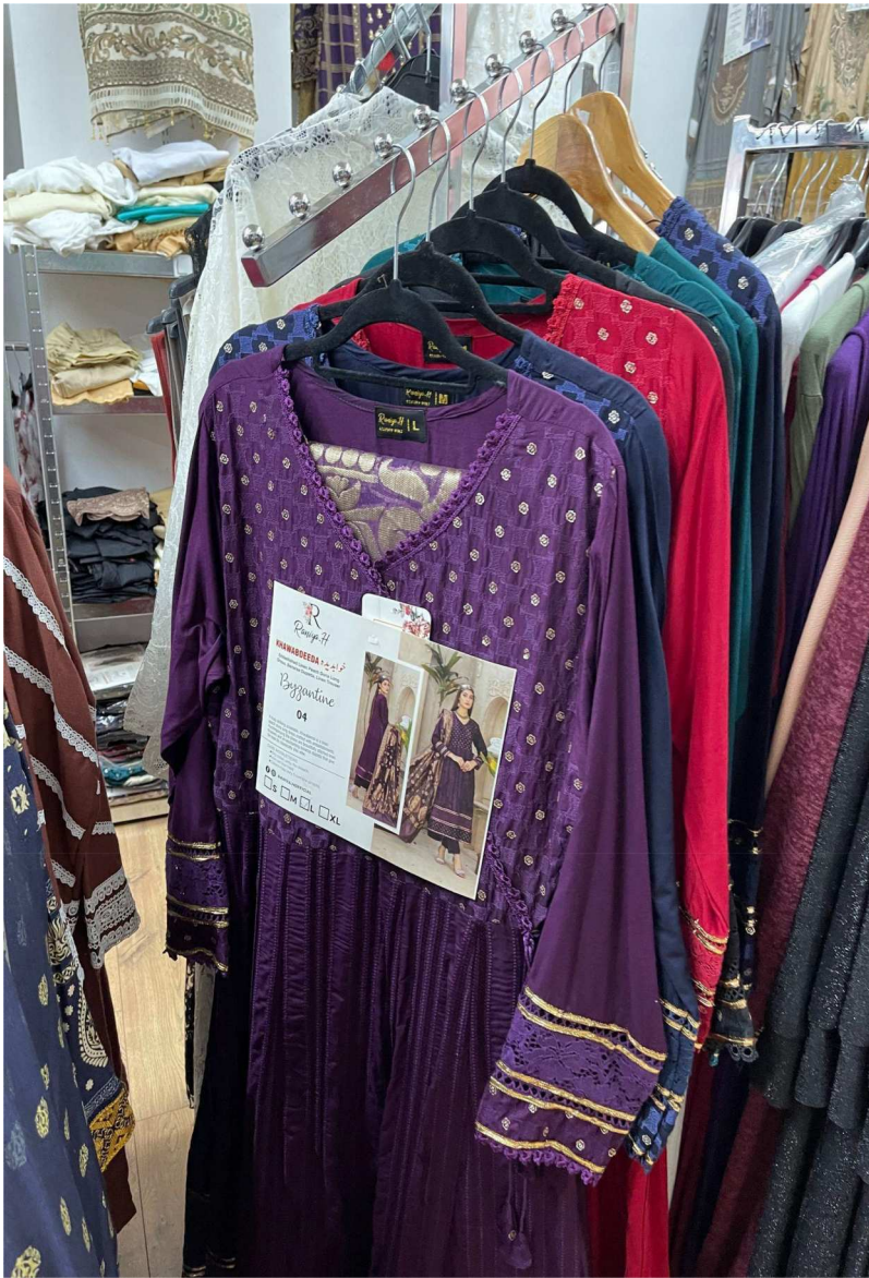
Figure 5. Salwar kameezes made of 100% cotton fabric with synthetic laces and ribbons. Note the style name, 'Byzantine'.

and manufacturing practices (Stringer et al., 2022, p. 721). Therefore, a fashion consumer may be indifferent to or unable to connect with sweatshop conditions and environmentally harmful practices in a geographically distant place due to spatial and social distance.