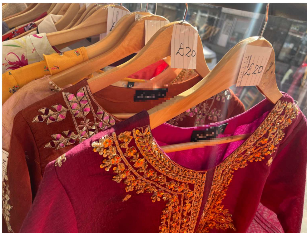
Figure 10. Miriam's own designs. Photo by the authors, 30 June 2022.

Similar to Zeenat, Miriam refrains from wearing South Asian clothing in 'mixed' spaces, such as when shopping in high-street stores or dining in restaurants. However, she proudly and happily dresses in South Asian styles when in the 'South Asian' social sphere. Miriam emphasised that, especially as a shop owner, she is expected by the