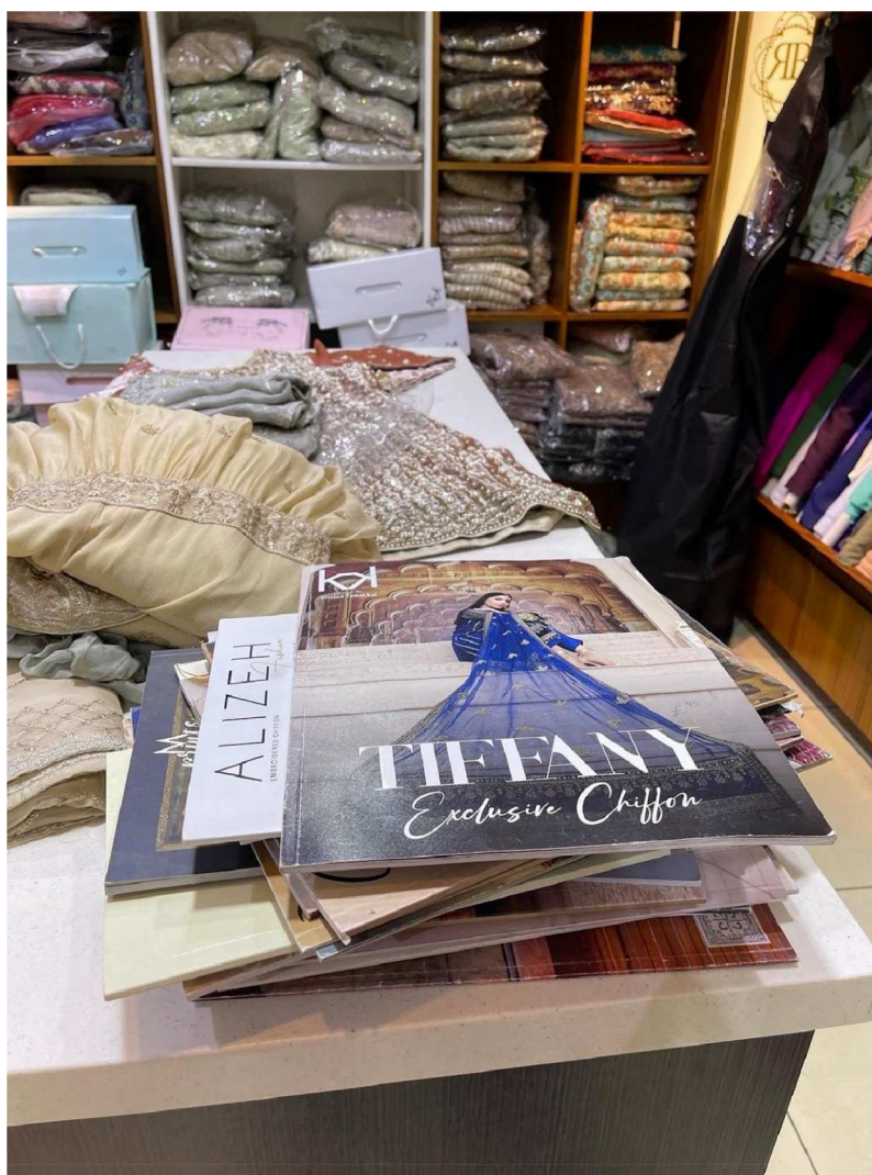
Figure 2. Product catalogues in a South Asian store on Glasgow's Cathcart Road. Photo by the authors, 11 September 2022.

a common presence in most stores on Cathcart Road, were also browsed and photographed (see Figure 2 ). Additionally, the research included a visit to Glasgow Mela on Sunday, 26 June 2022.