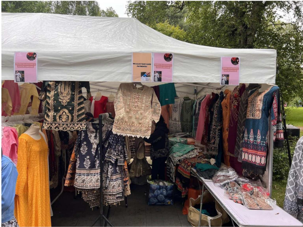
Figure 4. The Glasgow Mela 2022. 26 June 2022.