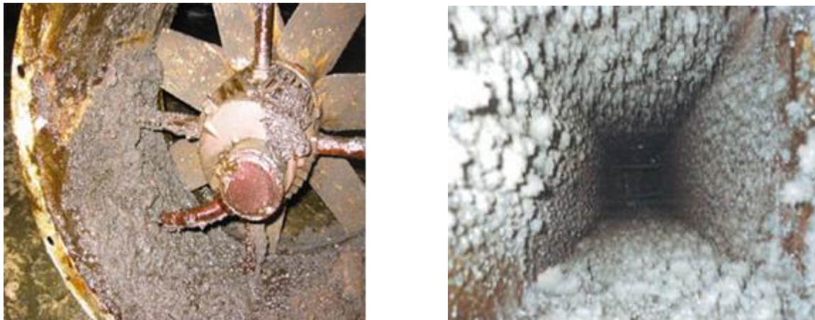
Figure 1 – Thick dust accumulation and discolouration at critical junction of Mechanical ventilation and A/C ducting system as stipulated by the Energy Performance in Buildings Directive (EPBD)

visitors, patients and staff. Adding to that hospitals require a more robust around-the-clock management input to ensure effective functionality and quality maintenance of both assets and services systems adding to the complexity involved. Equally, a hospital environment can be a reservoir for potentially infective agents as shown in figure 1, which needs controlled and managed effectively.