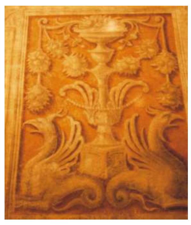
Fig 13: Vincenzo Frediano of Lucca, Basilisks , fifteenth century. Fresco. Lucca, Cathedral of San Martino, interior of entrance wall.