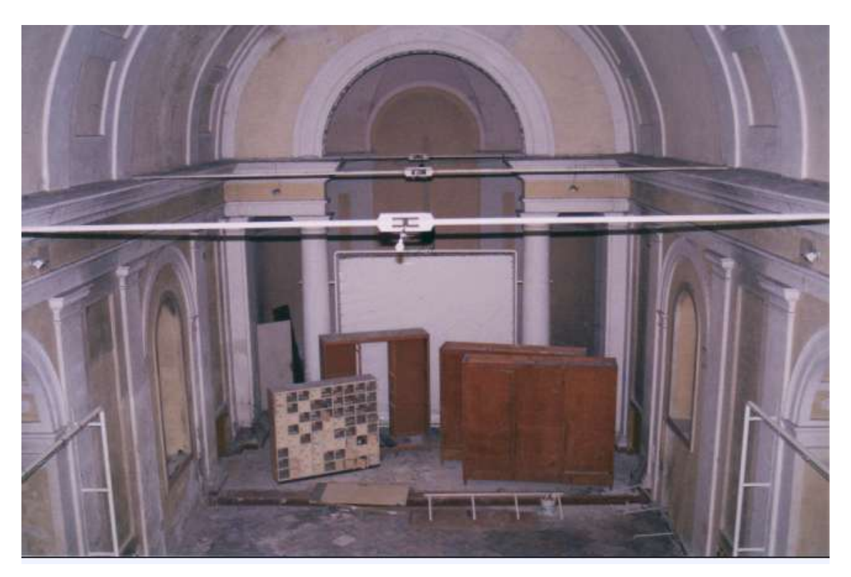
Fig 6: Interior of former church of Santa Maria dei Fossi, showing neoclassical decoration of 1852-5 completed under Giovanni Santini.