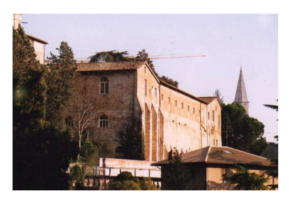
Fig 2: Outer cloister wall of Santa Maria dei Fossi, as seen from Via Fratelli Pallas adjacent to Stazione Sant'Anna. Distant right, campanile of San Pietro.