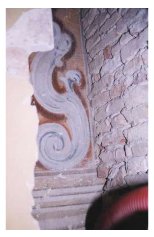
Fig 8: Excavated semicircular niche of 1852-5, set into fifteenth-century arched recess (west wall), showing frescoed designs of c1718.

Fig 9: Pietro Perugino, Family of the Madonna , 1500-02. Oil on wood, 296 x 259 cm. Marseille: Musée des Beaux-Arts, formerly in Santa Maria dei Fossi (Fig 7).