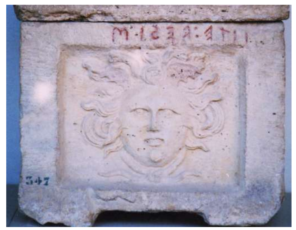
Fig 14: Head of Medusa, cinerary urn from tomb of the Tite Vesi family at San Sisto, late-second to early-first-century BC, excavated sixteenth century. Travertine. Perugia: Museo Archeologico Nazionale.