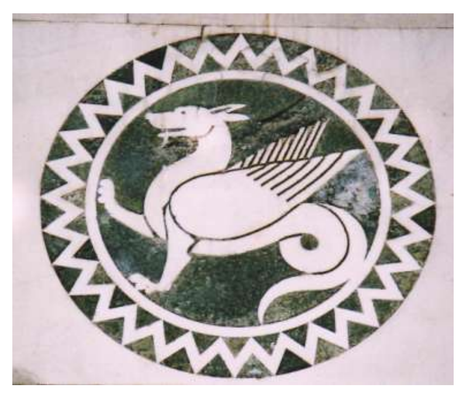
Fig 12: Guido Bigarelli, Basilisk , first half of thirteenth century, marble inlay. Lucca, Cathedral of San Martino, atrium, adjacent to right entrance.