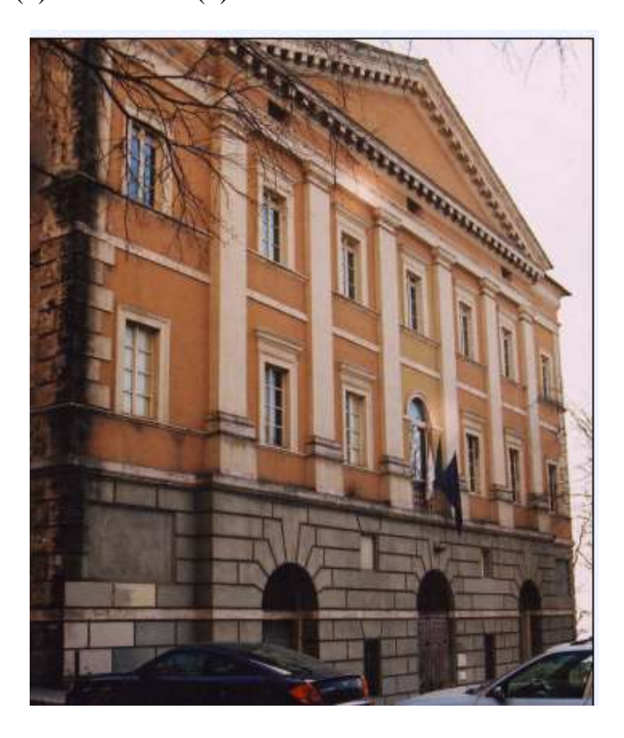
Fig 4: Façade of Scuola Media Statale San Paolo, Viale Roma, behind which lie the former church and conventual buildings of Santa Maria dei Fossi.