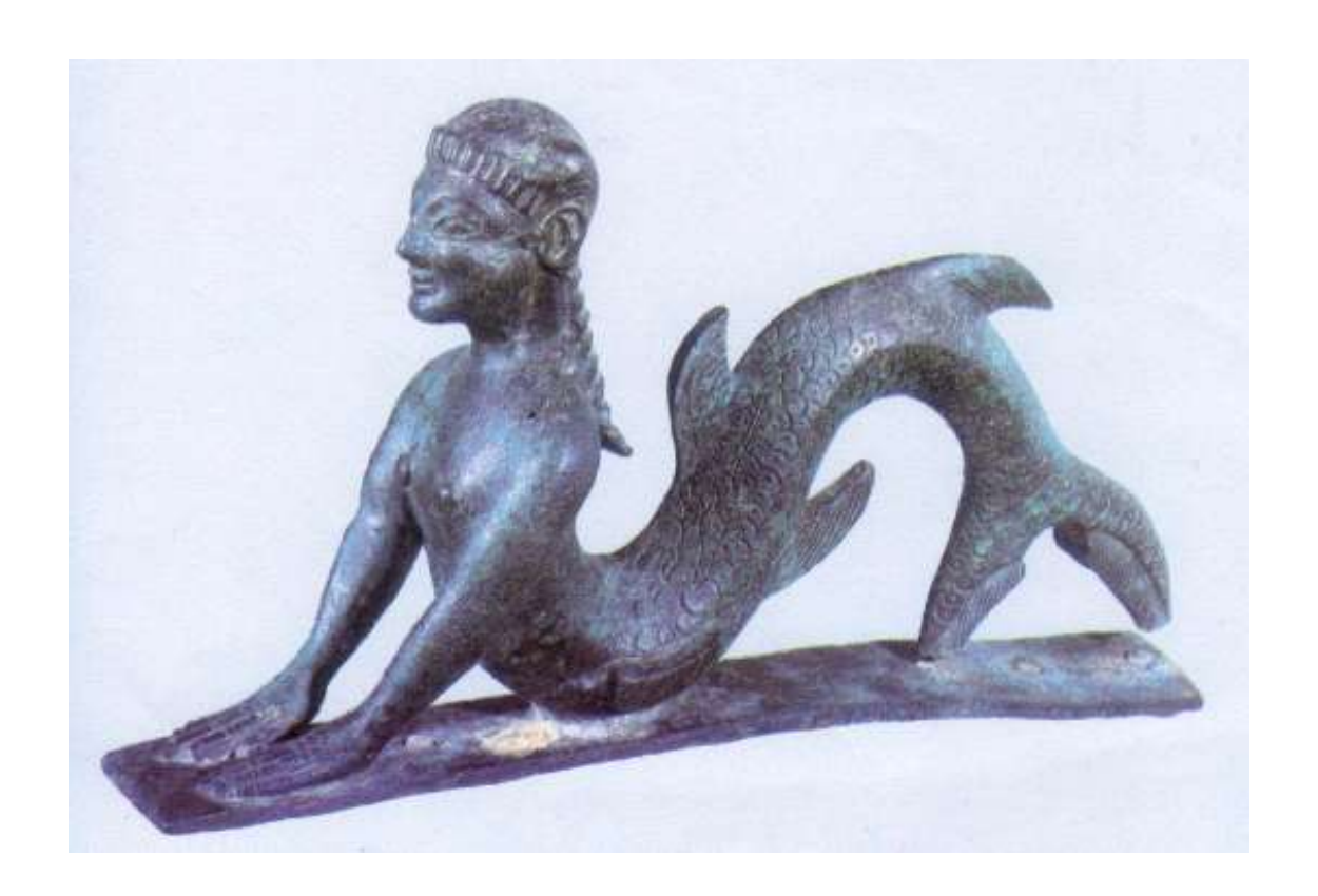
Fig 11: Etruscan statuette of a mermaid, third quarter of sixth century AD. Bronze, length 19.8 cm. Perugia: Museo Archeologico Nazionale (inv. Bellucci 1422).