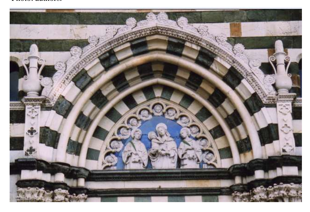
Fig 18: Andrea della Robbia, tympanum decoration above main entrance of Prato Cathedral, flanked by flaming, vase-shaped lamps, 1489. Marble. Photo: authors.

Fig 17: Domenico Ghirlandaio, The Apparition of the Angel to Zacharias (detail), 1485-90. Fresco. Florence: Tournabuoni Chapel, Santa Maria Novella. Photo: authors.