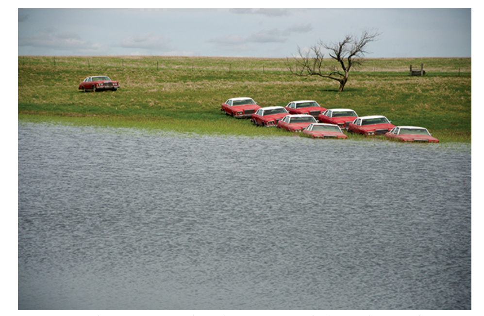
Jonathan Day, North Dakota, 'Postcards from the Road', Lumevisum, Hong Kong, 2015.

as I write. Maybe Wordsworth was wrong to lionise "emotion recollected in tranquillity"<sup>12</sup>; maybe all tranquillity does is ameliorate the rawness.