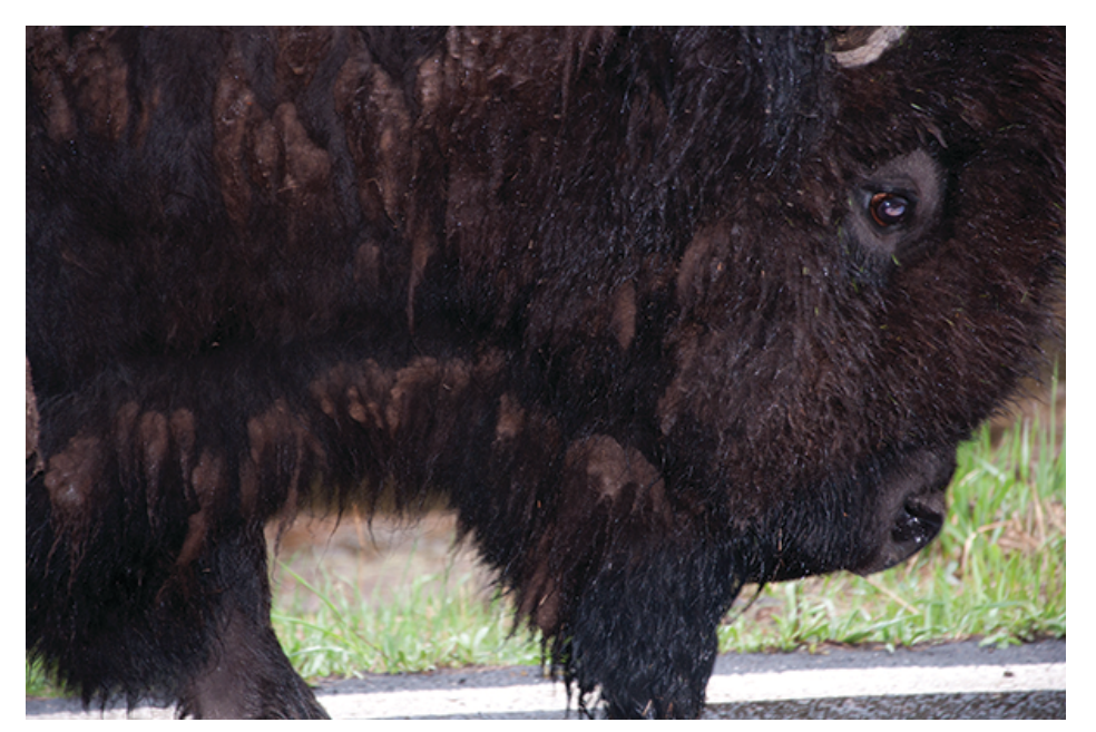
Jonathan Day, Prairie, 'Postcards from the Road', Lumevisum, Hong Kong, 2015.

It is a little awkward between he and I-he is a man of few words I can see, more used to boats and bait than conversation. But I linger, nonetheless, next to his cigarettes and root beer, just to wonder how it would be to live here and be him, in this mermaid land of water. I can feel the treacle-dense darkness, covering everything in its quiet flood, hear the water plop of giant redfish taunting me with every swallowed fly, taste the half-salt, half-silt fillets which, after an excess of eating, leave him almost as much fish as they. I pull on another cheap Pall Mall cigarette, take a slug of Barg's root beer and wake up from my afternoon drowsiness, bid Ray farewell and get out of there.