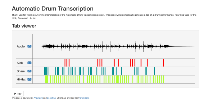
Figure 1. Screenshot of a completect transcription.

© Carl Southall, Nicholas Jillings, Ryan Stables, Jason Hockman. Licensed under a Creative Commons Attribution 4.0 International License (CC BY 4.0). Attribution: Carl Southall, Nicholas Jillings, Ryan Stables, Jason Hockman. "ADTWeb: An open source browser based automatic drum transcription system", Extended abstracts for the Late-Breaking Demo Session of the 18th International Society for Music Information Retrieval Conference, Suzhou, China, 2017.