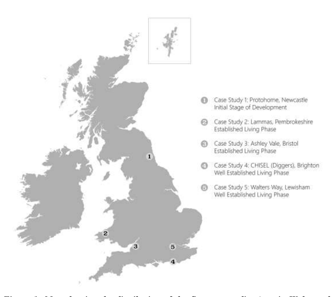
Figure 1: Map showing the distribution of the five case studies (one in Wales and four in England)

Owing to a lack of consistent theory and ambiguous results from existing studies on the effects that community-based projects have on social cohesion, social capital and participation, a Constructivist Grounded Theory (CGT) approach was used to inform theory based on empirical data analysis (Denscombe, 2014; Higginbottom and Lauridsen, 2014). The research process included primary and secondary data collection from self-build case studies, coding of empirical data and comparison between case studies, as well as between the selected case studies and the reviewed literature to elicit and assess how social interactions between people and social phenomena, such as sense of community, are constructed (Bryman, 2012; Creswell, 2014).