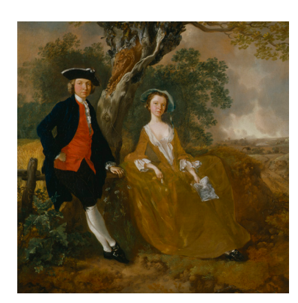
Figure 3. Stik's reinterpretation of Thomas Gainsborough, A Couple in a Landscape (1753), 2012. By Permission of Stik