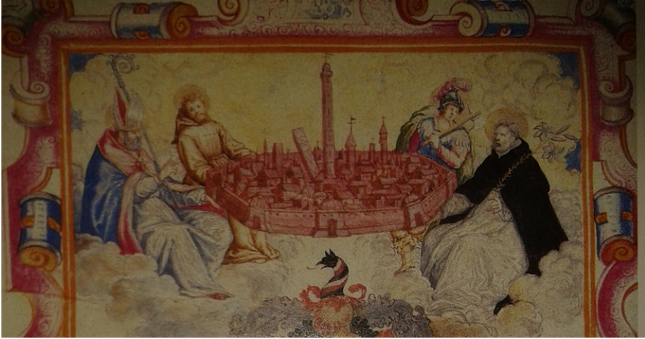
Fig. 1 - Felsina and Saints Petronio, Francesco and Domenico watching over the city. (Bologna, Archivio di Stato, Biblioteca, Insignia degli Anziani , VI bimestre, 1599).

of his divine authority and thus – according to the argomento , if not historical fact – managing to effect world peace: «guadagnò l'ossequi alla fede, la riverenza all'ecclesiastica potenza, e la pace à tutto il mondo» [ he gained respect for the faith, reverence for ecclesiastical power and peace for all the world ]. The libretto celebrates an occasion when one of Bologna's sons played an important role on the international stage. In addition Nicolò was acting as the pope's deputy, mirroring the way in which, as the second city of the Papal States, Bologna saw her role in the Catholic Church.