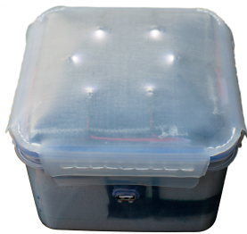
Figure 1: 1st Prototype Instrument

The effects of design constraints in prototype instruments were apparent, although the explicit focus in Wright’s own research, which explored the design of sonic-play instruments with a small group of non-verbal young people on the autistic spectrum. Two prototype DMIs were developed over the process of this research. Both had a Skoog-inspired cuboid form factor, embedded loudspeaker, and embedded audio synthesis and LEDs using the BELA platform and SuperCollider [27]. The prototypes differed from one another in other respects, designed to target separate issues identified for the design of sonic-play instruments.