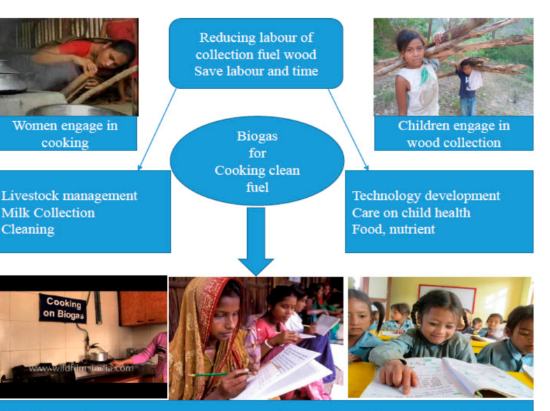
Cooking on biogas, women empowerment, education - Improve rural life style