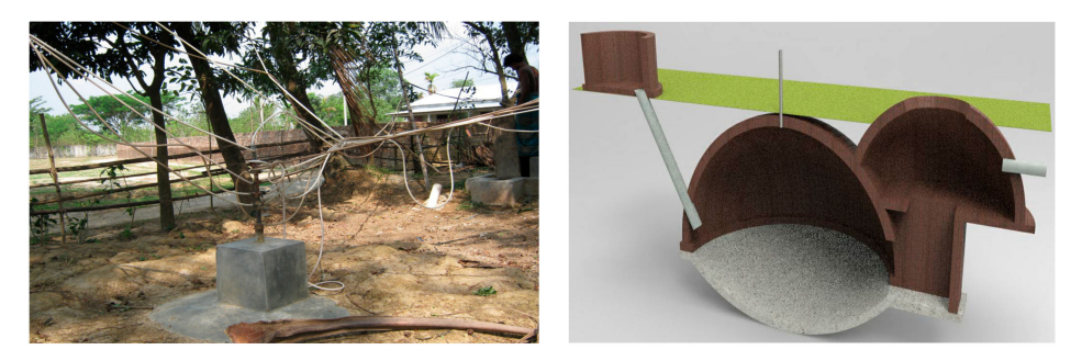
Figure 2. A Domestic Fixed Dome Biogas Plant Constructed from Brick, Sand and Cement ( Left ) and a Simulated Side View of an AD Plant ( Right ) [24].

Van Ness et al., [14] proffer that a typical domestic biogas plant saves 2000 kg of wood fuel a year and that 1000 biogas plants can save the felling of 33.8 ha of forest each year—refer to Figure 2. for a typical example of a biogas plant [49]. Biogas can be used to replace kerosene for lighting and/or cooking [24], with a typical saving of about 32 L per year. This reduction in usage of flammable liquids has an incidental benefit of mitigating house fires that occur when lamps are inadvertently knocked over.