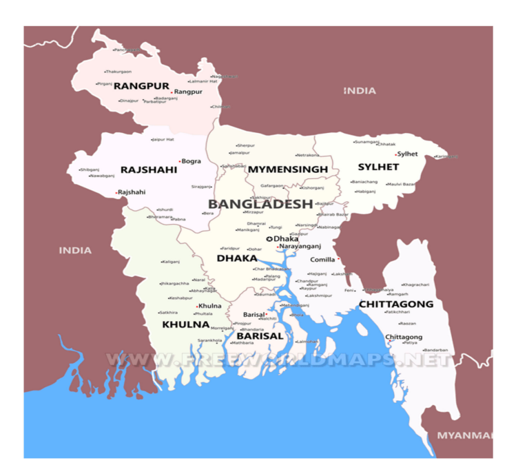
Figure 4. Map of Bangladesh Showing Dhaka (including Manikgong and Narshindhi), Mymensingh and Barisal [64].

For this research a post-positivist and inductive methodological approach was adopted (with elements of an interpretivist epistemological lens) to assess whether the use of AD could enable rural people to meet SDGs (Table 1). A semi-structured survey of Bangladesh was undertaken (covering five districts and twenty plants built by three Bangladeshi extension agencies) to determine the impact of using AD on the lifestyles of plant owners. These districts were: (i) Dhaka; (ii) Manikgong; (iii) Narshindhi; (iv) Mymensingh; and (v) Barisal. Dhaka, Manikgong and Narshindhi are in the Dhaka division which is in the centre of Bangladesh, Mymensigh is in the northern part and Barisal is in the southern part (Figure 4). The three construction agencies were: (i) the Bangladesh Council of Scientific and Industrial Research (BCSIR); (ii) the Local Government Engineering Department (LGED); and (iii) the Grameen Shakti (GS). The districts were selected randomly but samples were chosen so that certain aspects were representative of a broader area such as: the transport system, biomass resources and biogas plant access. BCSIR, LGED and Grameen Shakti are three pioneering organisations within Bangladesh who deal with anaerobic digestion and biogas.