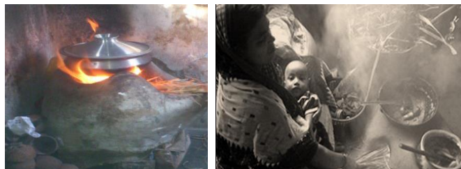
Figure 1. Typical example of a traditional biomass cooking stove [15].

Rural people in Bangladesh constitute 76% of the population and regularly use a mud-built cylinder stove (placed on three raised plinths and situated above or below ground level) for cooking and heating purposes—refer to Figure 1 [13]. An opening between these plinths provides a convenient fuel-feeding port, whilst conversely, the remaining two openings provide flue gas exit ports. This mode of biomass cooking within domestic properties creates a significant volume of indoor air pollution and represents a major public health hazard for occupants [14]. This is because, traditional biomass fuels generate more pollution than comparatively cleaner alternatives, such as kerosene or biogas. The cumulative impact of burning biomass upon both the general public and environment dictates that new and/or alternative sources of energy production are urgently required in Bangladesh.