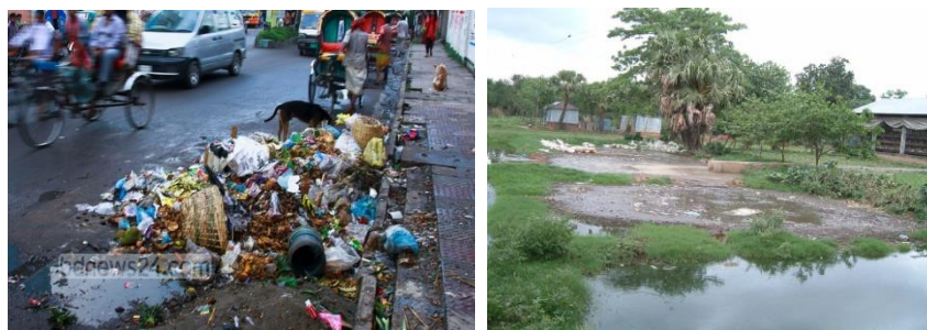
Figure 4. Roadside waste dumping in Dhaka (left) and dumping of poultry litter adjacent to water courses (right) [31]. (Reproduced with permission from Gofran, 2009).

Current and previous research work [28] shows that dung from cattle small holdings is mainly suitable for domestic sized AD plants, while wastes from poultry farms are more suitable for medium sized plants. Wastes from cattle markets can be used in large or extra-large AD plants. We can categorise the AD plant sizes according to their daily biogas yield capacity as: Small domestic ( <2 \text{ m}^3 ), domestic ( 2\text{--}5 \text{ m}^3 ), medium ( 5\text{--}25 \text{ m}^3 ), large ( 25\text{--}150 \text{ m}^3 ) and very large ( >150 \text{ m}^3 ).