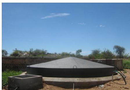
Figure 3. Typical example of a biogas supplied via flexible pipeline in India [48] (reproduced with permission from Reddy, 2015).

has been created through the sales of biogas to their neighbours. Typical biogas charges to rural families oscillate around 800–1000 taka (£8–£10) per month and this steady income stream ensures that pay-back of installation costs occur over a shorter period of time [28]. For example, this present research study found a singular poultry and similarly, another dairy farmer selling biogas to their neighbours via an innovative and affordable flexible pipeline. Other plant owners were observed to be selling biogas to up to six households from a singular 10 m 3 biogas plant; each household had to pay 500 taka (£5) per month for this instantaneously biogas service, thereby generating 3000 taka (£30) for the farmer. According to an estimation provided by Islam [44,45] the total cost to build a sand cement, brick made fixed dome biogas plant (Figure 3) having biogas capacity 10 m 3 (a day) is around 250,000 taka (£2400). Many biogas plants are purchased by poor rural households via loans offered by the government, banks/financial institutions or NGOs—even when generous subsidies are available [45–47].