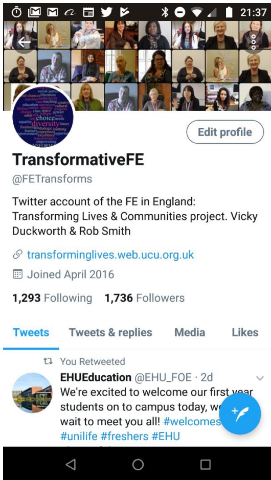
Figure 4. Twitter project homepage.

were used to link to the reports produced at different stages of the project. In addition, we used free websites to make GIFs that functioned in the same way as the collages: providing an artefact to attract a larger audience.