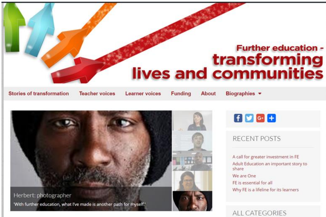
Figure 1. Project website landing page.